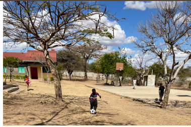
Kajiado campus had no grass or leaves on trees.

In November 2022, Hope For Kajiado raised $10,000 to provide a month's groceries for 200 vulnerable families most impacted by the drought.