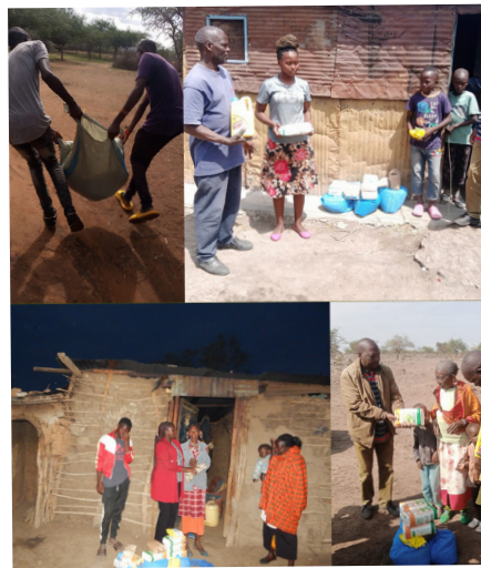
KCH staff delivered a month's groceries to 200 families.