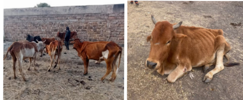
When visiting, seeing the cattle was heartbreaking.