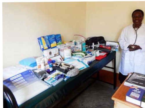
Kajiado Children's Home - Nursing Services