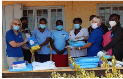
Kajiado County Referral Hospital

Our mission team took much needed PPE supplies to area hospitals. Please enjoy these photos from Kajiado & the PPE Distribution: