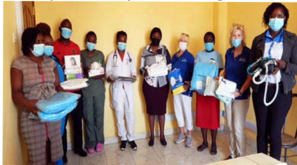
Kajiado Kitengela Medical Services